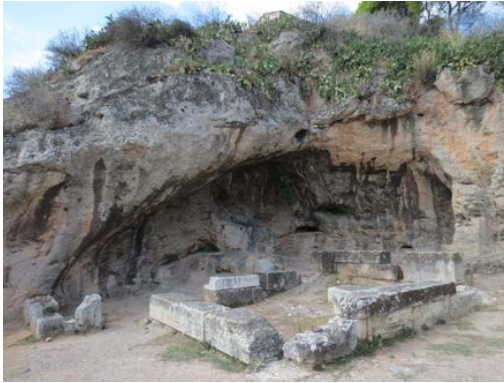
Fig. 2. Semi-spherical cave of Hades, portal to the world beyond, at Eleusis today, about 18 kilometers outside Athens (Photo: G. Latura).

where the gates to Hades are. (Athanasakis, Wolkow, 2013, p. 19)