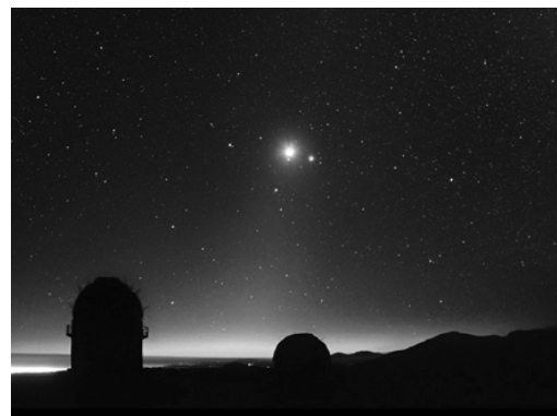
Fig. 5. Zodiacal light rises from the horizon and envelops the crescent Moon and planets, at Skinakas Observatory, Crete, October 7, 2007.

The torch-lit procession was followed by a pannychis – an all-night vigil that was a common feature of Greek festivals (Parker 2005, p. 166) and suggests an astronomical connection. Since the zodiacal light only appears for a short period before sunrise in the fall, a night-long vigil would ensure that initiates would be awake to witness the miraculous sight shortly before dawn.