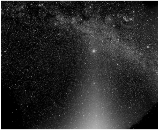
Fig. 4. The zodiacal light rises from the horizon, envelops planets along the ecliptic, and intersects the Milky Way

ible – to those who know when to look, in what season and at what time of the night (Figure 4).