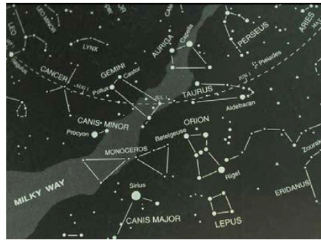
Fig. 1. The intersection of the Milky Way and the Zodiac – the path of the Planets – where stood the gates of the afterlife according to Macrobius. (Planisphere: Heifetz)

In support of this theory, we have the Commentary on the Dream of Scipio , where, as we've seen, Macrobius locates the portals to the beyond at the intersections in the sky (Figure 1) – following Cicero, who had followed Plato.